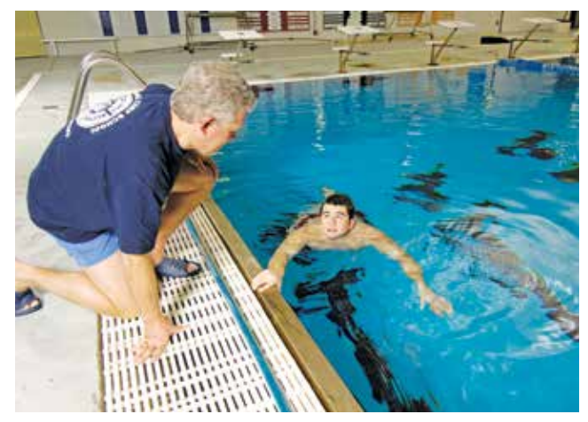
Rest stops are not allowed. However, the course should be close to the side to allow for resting and easy assists if needed.

fall just short of the required distances may be given a few pointers, a rest, and another try. Those who cannot complete the tests should be congratulated on how far they got, encouraged to practice, and told that they will be able to retake the test at a later date. If a person in a swimsuit at the swimming area decides not to take either test, then they should be encouraged to slip into shallow water and show what they do know. That is, professed nonswimmers should be part of the overall unit activity, not shunted aside in the interest of time. Everyone should be encouraged to try to swim to the best of their ability, but no one should be coerced into the water.