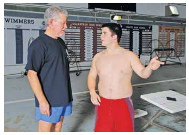
Participant is asked to describe test and confirm comfort with each task. If there is any hesitation, check ability first in shallow water.