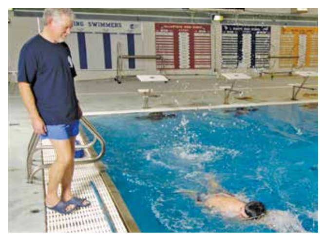
Tests measure comfort in the water but do not require perfect form.

Although the tests may be explained to the unit as a whole, the test administrators should briefly review the tests with each participant. Each person should be asked if he or she would like to first try the beginner or the swimmer test. If the person asserts the ability to easily swim 100 yards, then it is not necessary to take the beginner test before the swimmer test. If a person is hesitant, they may take the beginner test first and follow it with the swimmer test if that seems appropriate. Those who