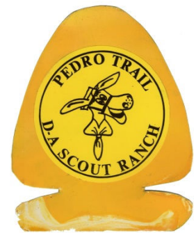
First Trail Marker

The OA Chapters scheduled several work weekends where they would brush and mark the trail. Some sections went easier than others since the Pedro Trail incorporated sections of existing trails as well as area of virgin territory. Trail markers were made from painted sheet metal pieces in the shape of an arrowhead with a yellow custom designed Pedro Trail sticker on it displaying the name of the trail and a smiling image of Pedro himself. In areas where the trail passed through the woods the markers were nailed to