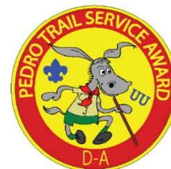
PEDRO TRAIL SERVICE AWARD