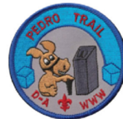
PEDRO TRAIL HIKING STAFF MEDALLION