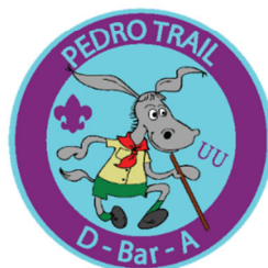
PEDRO TRAIL PATCH