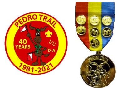
40th Anniversary Patch and Medal

14. RESALE ITEMS. Each paid participant will receive a special 40 th Anniversary Pedro Trail patch similar to the one on the front cover of this guide. Everyone is also welcomed to purchase additional items at our resale table located near the registration tables. Items available will be the Official Pedro Trail or Ordep Trail patch, Trail Loop rockers to go around the patch for each loop they hiked, a hiking staff medallion, Official Pedro Trail medal, horseshoe, and service pins to go on the drape of the Pedro Trail Medal.