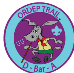
ORDEP TRAIL PATCH