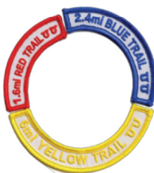
PEDRO TRAIL LOOP ROCKERS