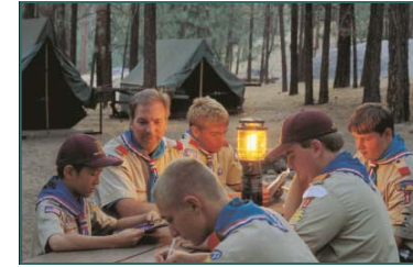
Great facilities & a well-trained, highly motivated Camp Staff will ensure a great week for your Scouts!