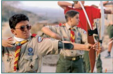
An outstanding program awaits your Scouts at our MCC Camps this summer!