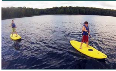
Every MCC Camp is dedicated to providing every Scout a fun-filled & memorable experience!