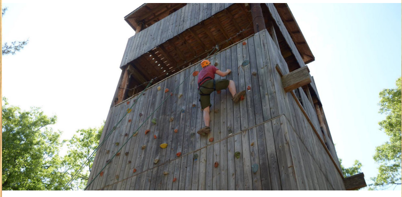
Gerber Scout Reservation