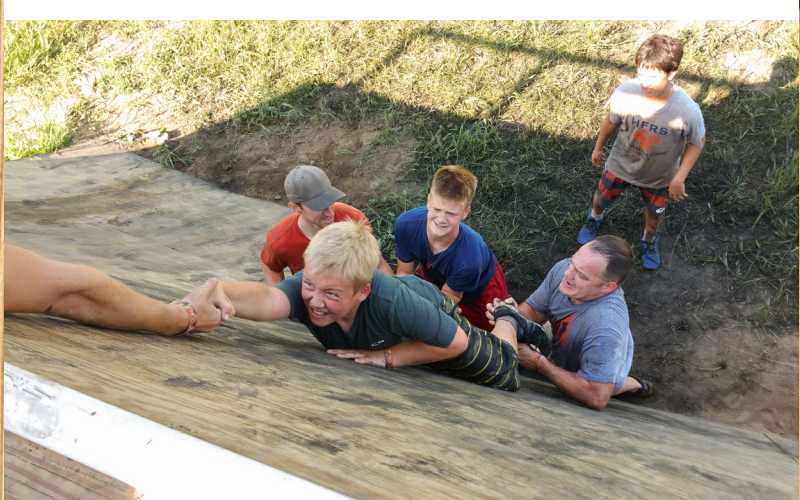
Great Lakes Sailing Adventure