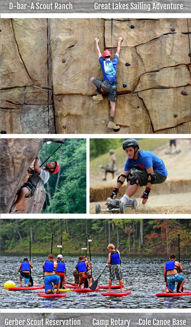
Gerber Scout Reservation Camp Rotary Cole Canoe Base